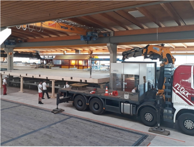
The platform is hoisted to the right place and placed in the hall