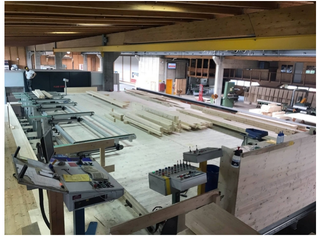
The new working platform offers a lot of space to the woodworkers