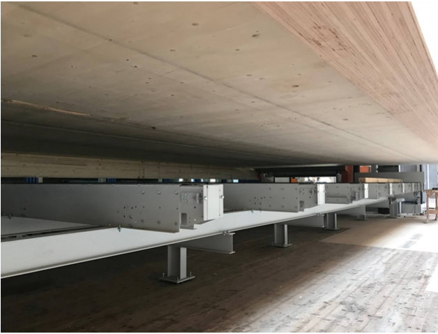
View of the construction of the platform from below