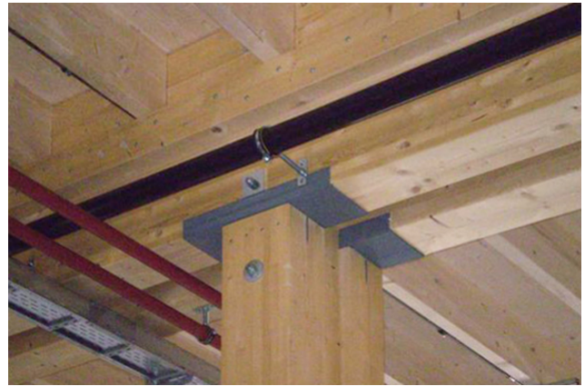
Transverse compression reinforcement with steel U-section, secondary supporting structure on bearing battens