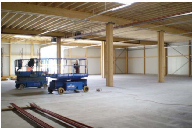
Interior view carcass

Twin girders made of glulam were chosen as the main girders, the girder dimension was 880 x 220 mm. The secondary structure consisted of ribbed slabs, the ribs made of glulam were glued above grade, rib dimension 320/80 mm, thickness of the three-layer slabs 42 mm. Wind bracing was provided by Swiss-Gewi bars arranged diagonally, with loads transferred directly to the foundations. Sandwich panels (d= 100mm) were used as external wall cladding.