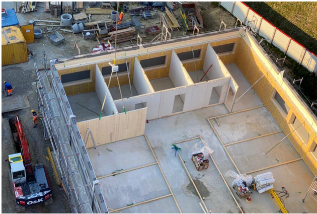
Mounting the interior walls