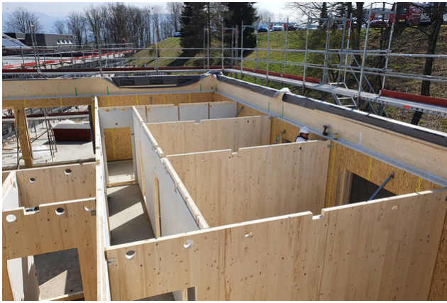
Interior walls in cross laminated timber