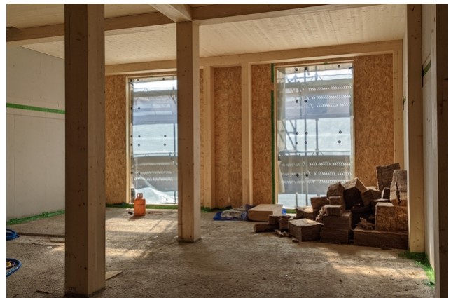
Behind it, the new wooden building is being built.