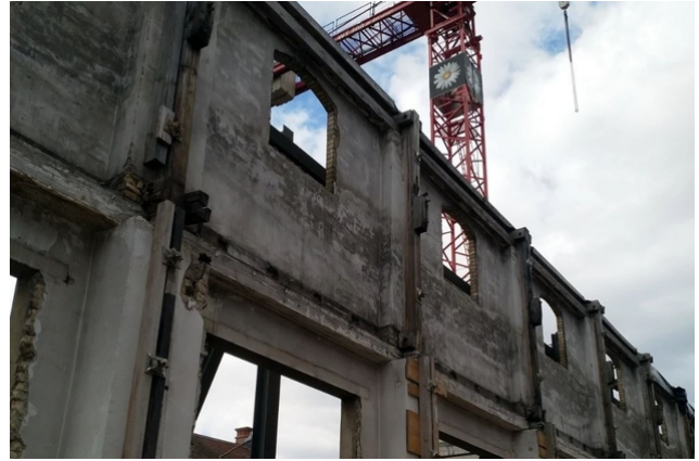
The building was deconstructed except for its facade.