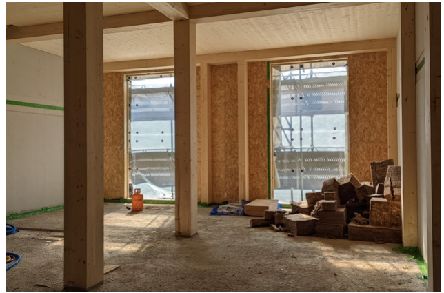
Behind it, the new wooden building is being built.