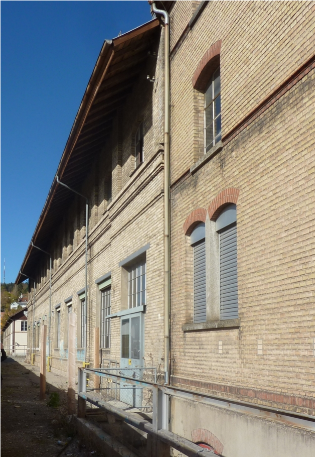
The facades are partially listed.