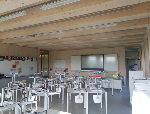
Interior of a classroom.