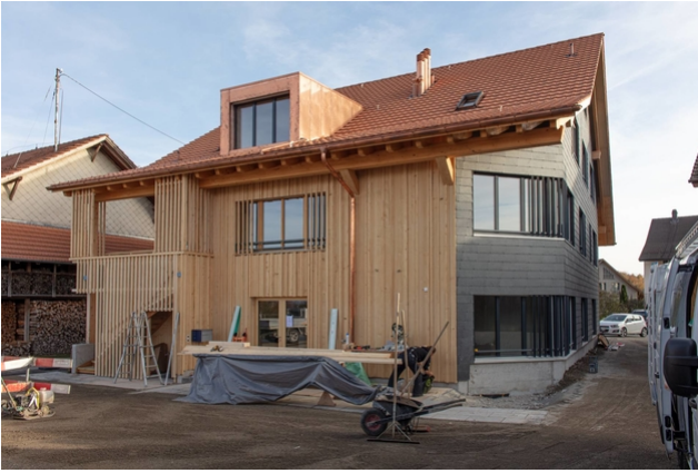
Fire protection facade to the neighboring house