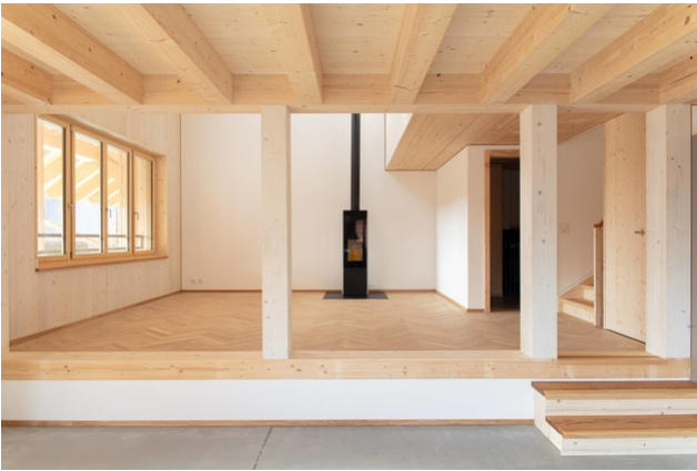
Interior view living room