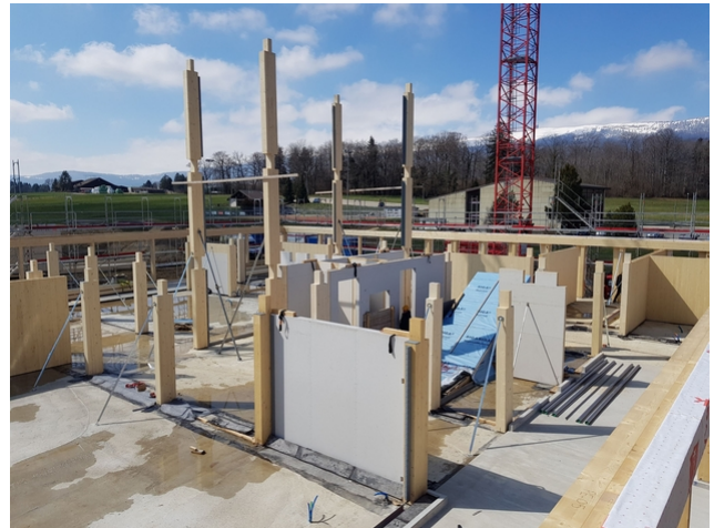
First floor under construction.