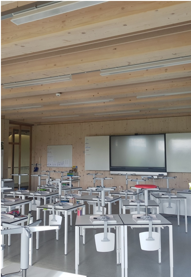
Interior of a classroom.