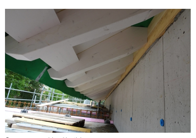
Canopy eaves side with sticher