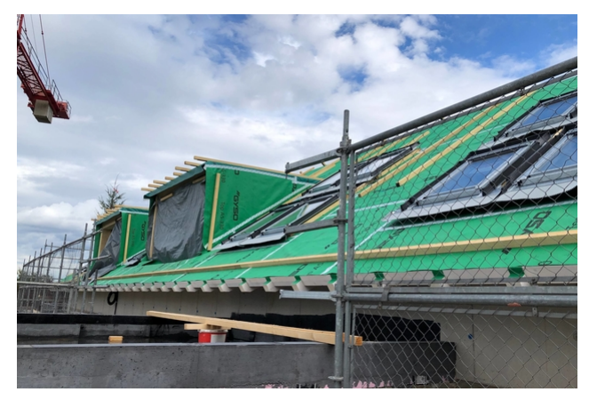
Increase in the construction phase