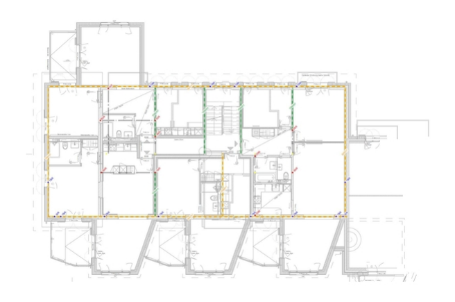
Load transfer plan