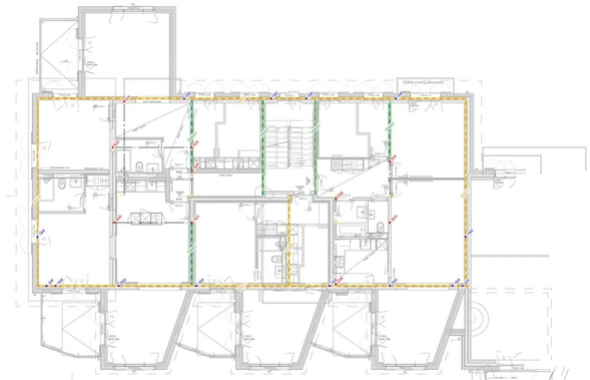
Load transfer plan