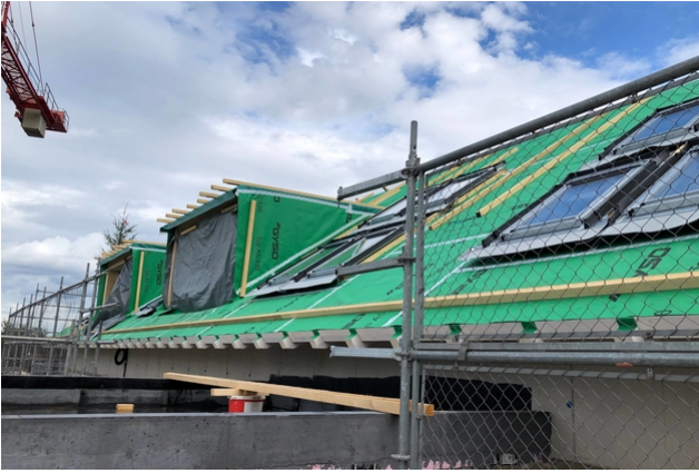
Increase in the construction phase