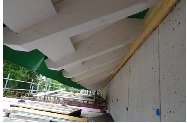
Canopy eaves side with sticher